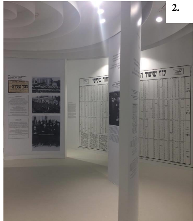
2. One of the exhibition rooms, with a Daf Yomi calendar visible on the wall.