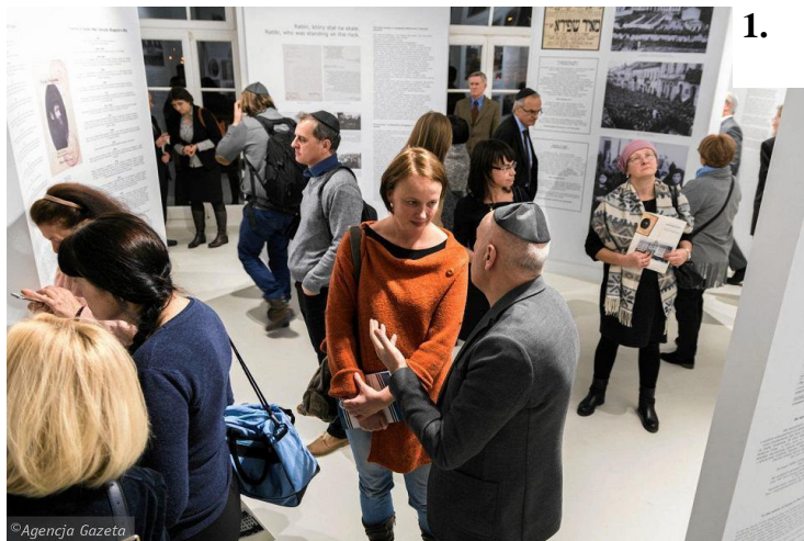
1. Opening of the multimedia exhibition „History of Yeshivat Chachmei Lublin”(07.12.2017).