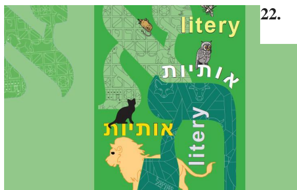
22. The cover of our Hebrew alphabet colouring book

This beautiful book can be bought at our Foundation!