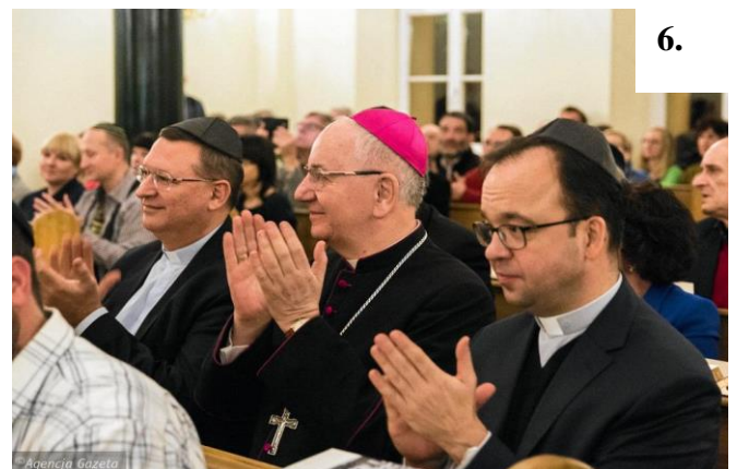
6. Clergy among guests at the opening.