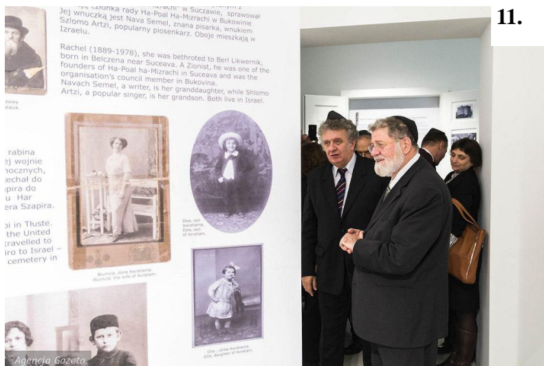
11. Exhibition hall with photographs from the family archive of Meir Shapira.